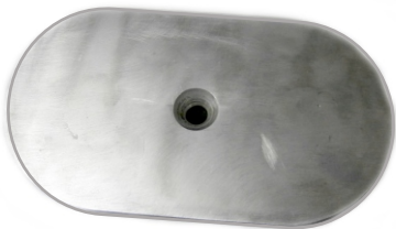
FRONT PATENT PENDING